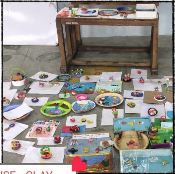
FEEDER HOUSE - CLAY MODELLING COMPETITION